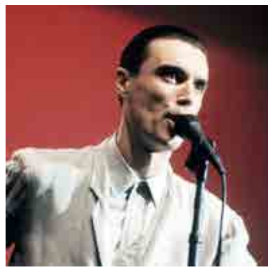
Stop Making Sense