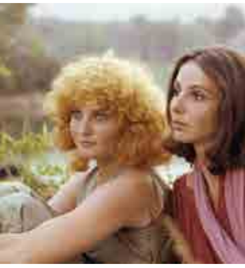
One Sings, the Other Doesn't | Photo courtesy of Janus Films