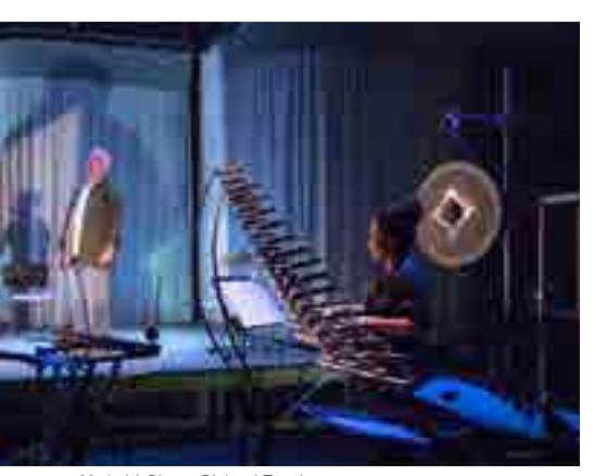
My Lai