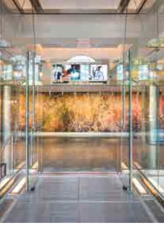
Gesture Performing Dance, Dance Performing Gesture, 2012 by José Parlá Fisher Building | Photo: Francis Dzikowski