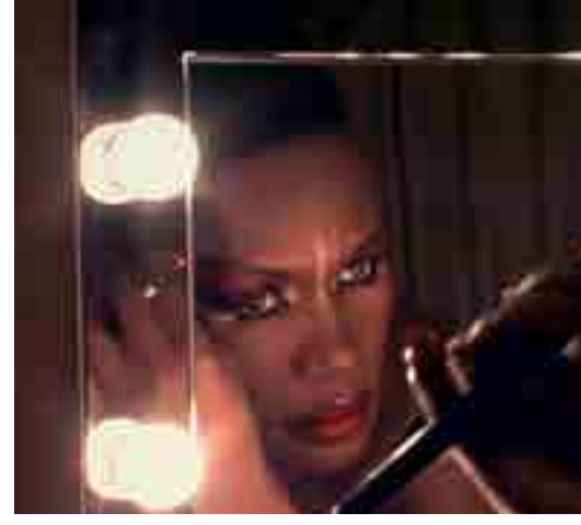
Grace Jones