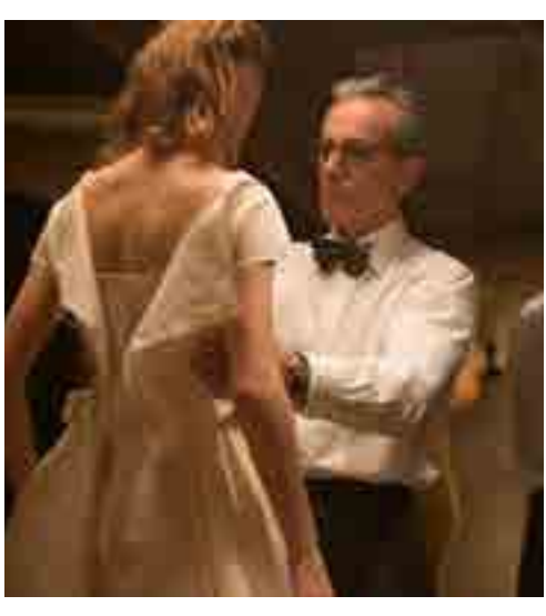
Phantom Thread