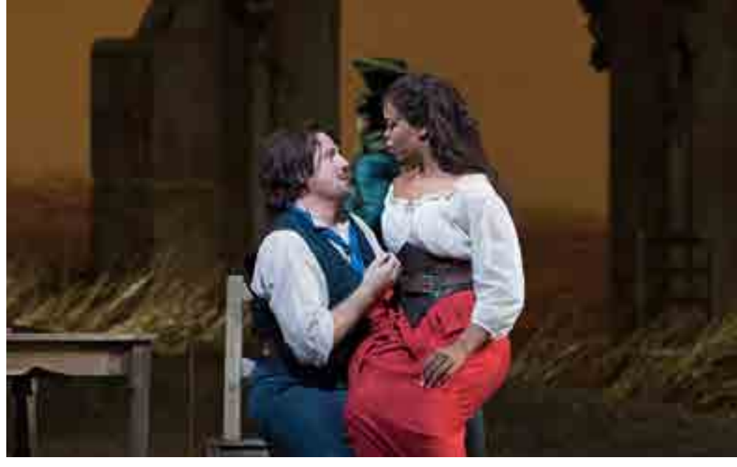
L: Hansel and Gretel. R: L'Elisir d'Amour.