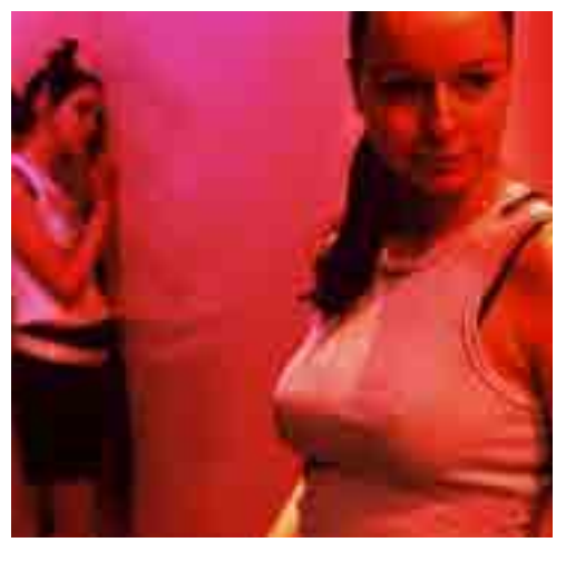
Morvern Callar | Photo courtesy of Alliance Atlantis/BBC Films

Human Flow - Ai Weiwei with moderator Laura Poitras