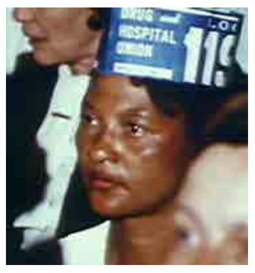
I Am Somebody | Photo courtesy of Icarus Films

Fight the Power: Black Superheroes on Film