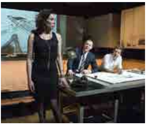
The Fountainhead