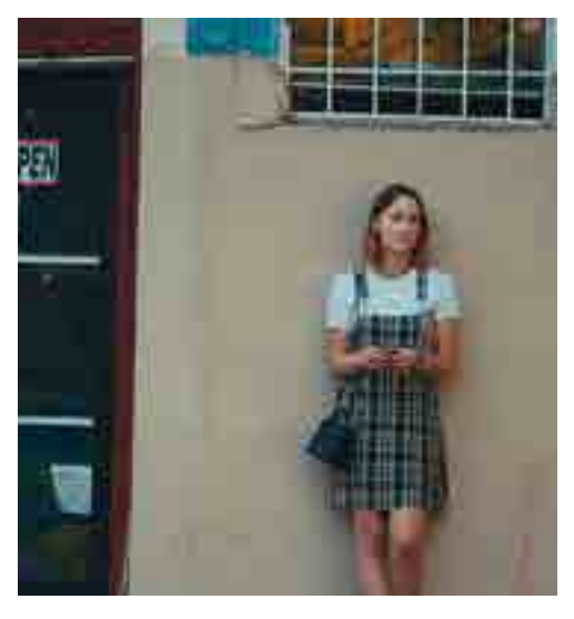
Lady Bird