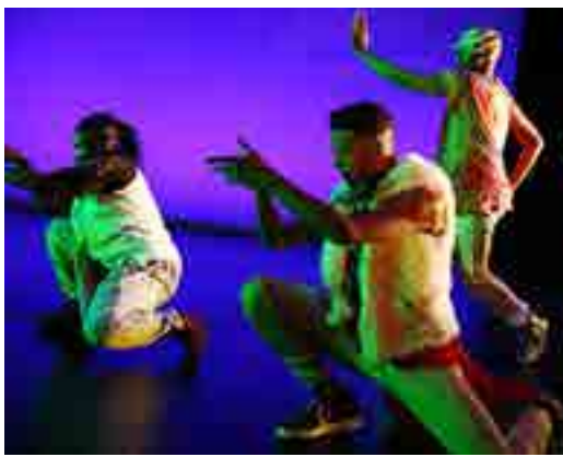
Virago-Man Dem | Photo: Julieta Cervantes