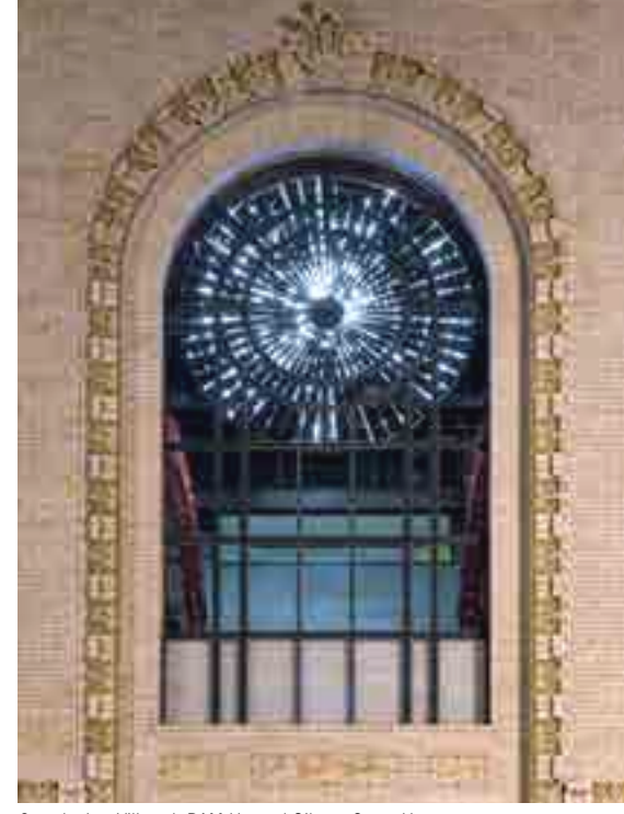
Stars by Leo Villareal, BAM Howard Gilman Opera House

THE COUNTRY'S OLDEST PERFORMING ARTS INSTITUTION SERVES AS AN ANCHOR FOR THE BROOKLYN CULTURAL DISTRICT