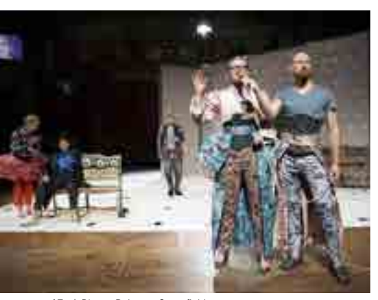
17c | Photo: Rebecca Greenfield