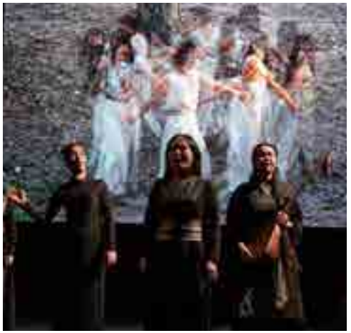
Qyrq Qyz