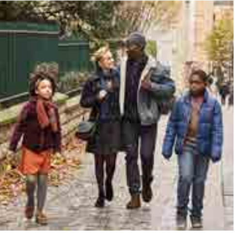
A Season in France