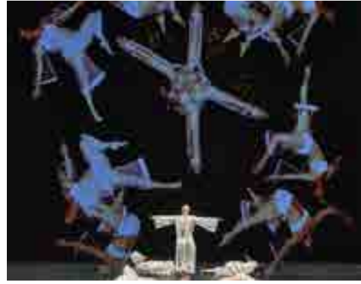
Tesseract