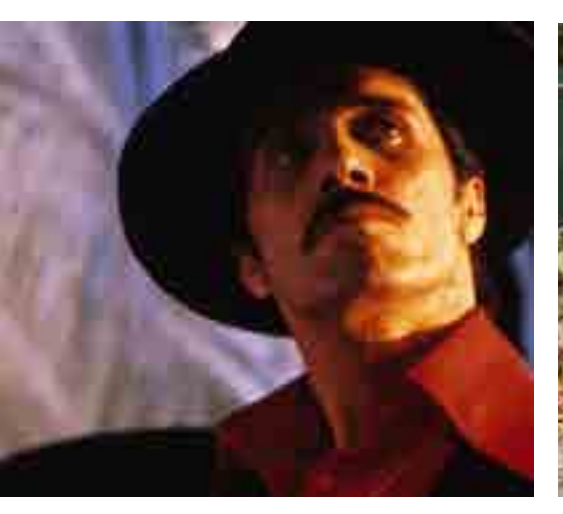
Zoot Suit | Photo courtesy of Universal Pictures