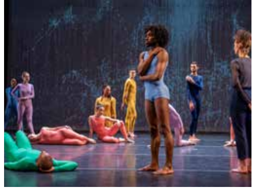
Night of 100 Solos

APR 12 & 13 OFERTÓRIO Caetano, Moreno, Zeca, and Tom Veloso