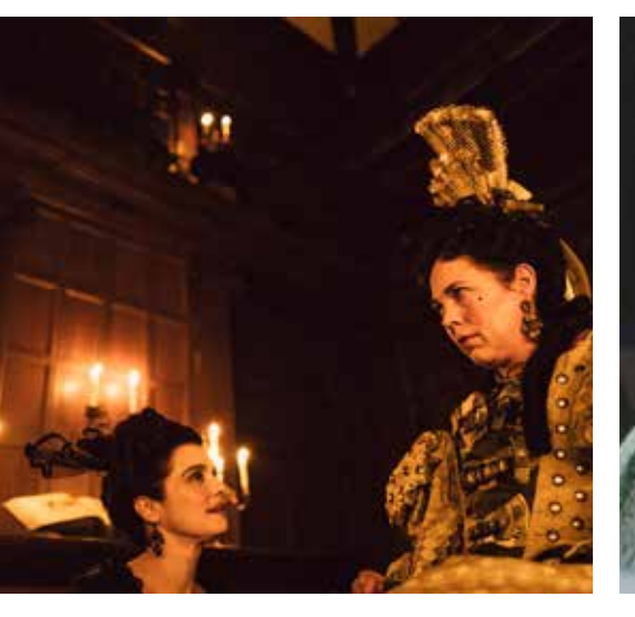
The Favourite