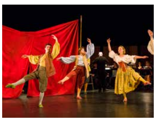
Rameau, maître à danser