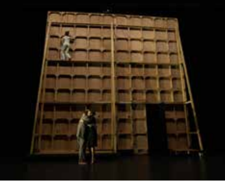
ESPÆCE