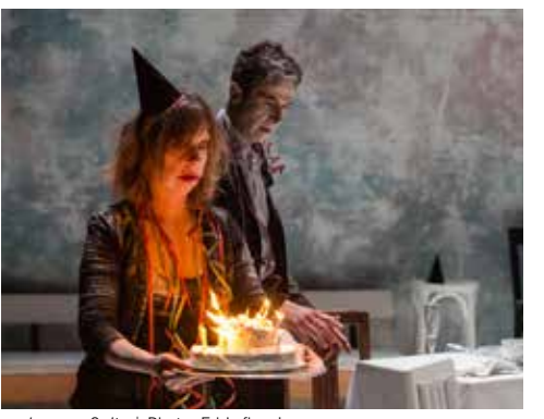
Ionesco Suite | Photo: Ed Lefkowicz