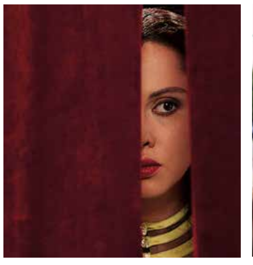
Looking for Oum Kulthum | Photo courtesy of Shirin Neshat and Shoja Azari