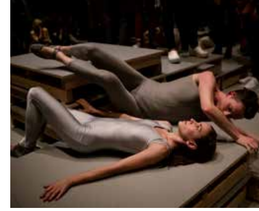
Interpassivities