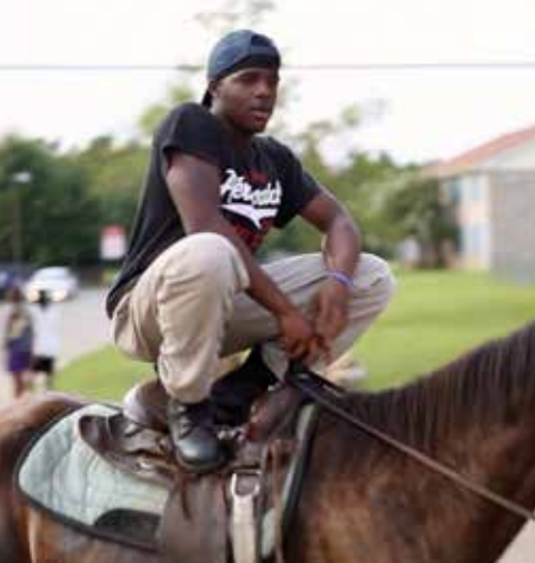
Hale County This Moring, This Evening