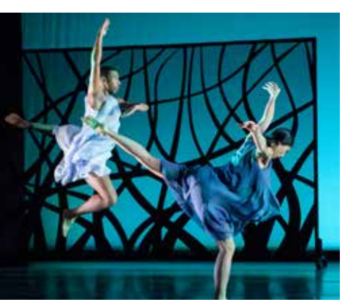
Everywhere All the Time

Alice Coltrane Turiyasangitananda: The Ashram Experience