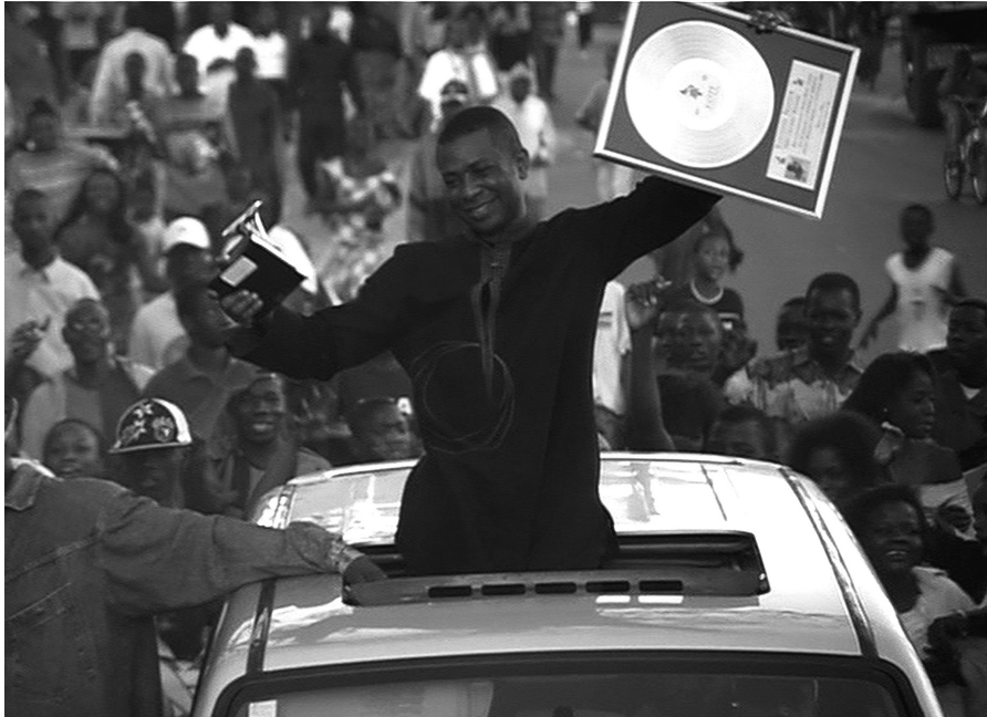
I Bring What I Love: Yousou Ndour