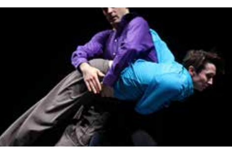
I don't believe in outer space | Photo: Julieta Cervantes

SABAB Theatre Written and directed by Sulayman Al-Bassam OCT 6—8