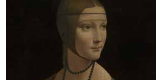
Leonardo Da Vinci's The Lady with an Ermine

ANNA BOLENA DON GIOVANNI SIEGFRIED SATYAGRAHA RODELINDA FAUST ENCHANTED ISLAND GÖTTERDÄMMERUNG ERNANI MANON LA TRAVIATA RING CYCLE DOCUMENTARY DAS RHEINGOLD (ENCORE) DIE WALKÜRE (ENCORE) SIEGFRIED (ENCORE)