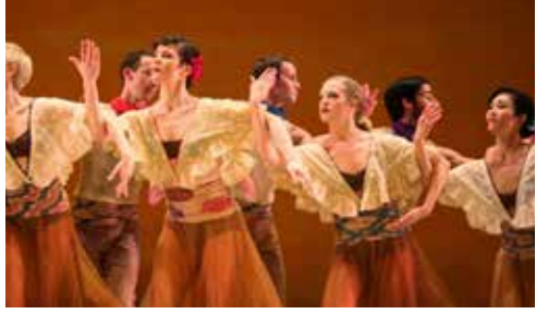
Mark Morris Dance Group

Produced by BAM A Louis Armstrong Tribute, MAR 29—31 Locked Down, APR 5—7 Funky but it's Nu Awlins, APR 12—14