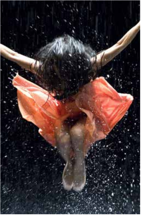
Pina in 3D

CIRCUMSTANCE CONTAGION DRIVE PEARL JAM 20 THE IDES OF MARCH THE SKIN I LIVE IN MARGIN CALL MARTHA MARCY MAY MARLENE THE DESCENDANTS MY WEEK WITH MARILYN