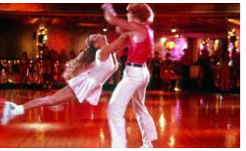
Skatetown, U.S.A. | Photo courtesy of Columbia/Photofest

CINEMACHAT WITH ELLIOTT STEIN: THE LOCKET