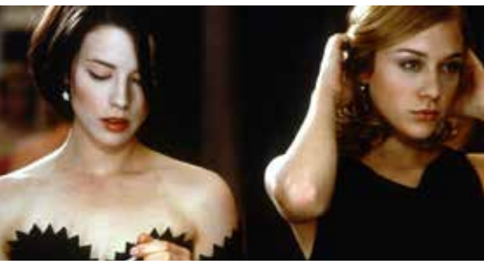
Hey, Girlfriend! series

VALENTINE'S DAY DINNER AND A MOVIE: THE SHOP AROUND THE CORNER AMERICA'S FILM LEGACY Author Daniel Eagan