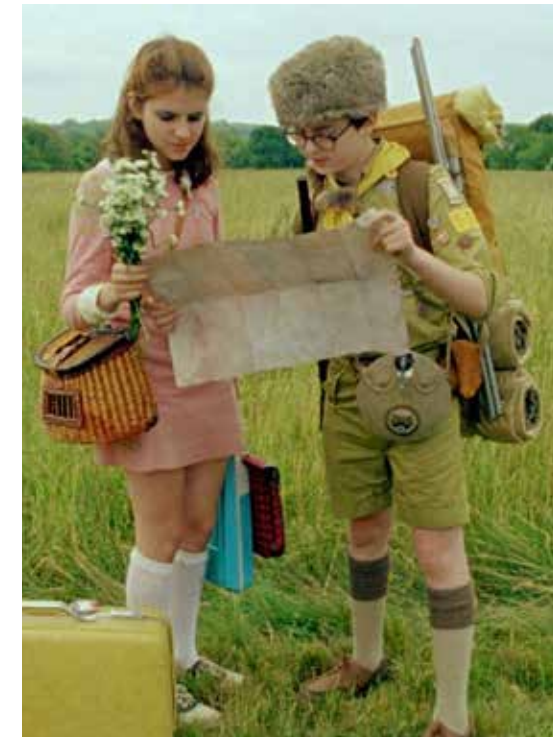
Moonrise Kingdom

2012 THE ARTIST A DANGEROUS METHOD PINA IN 3D A SEPARATION JEFF WHO LIVES AT HOME THE HUNGER GAMES THE KID WITH A BIKE JIRO DREAMS OF SUSHI BULLY MARLEY