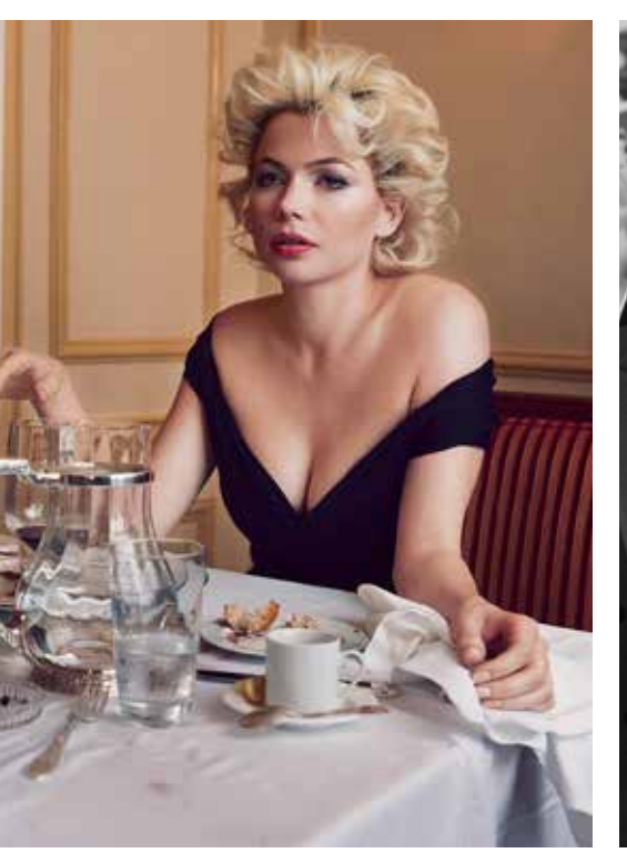
My Week With Marilyn

2011 MIDNIGHT IN PARIS THE TREE OF LIFE BEGINNERS BEATS, RHYMES & LIFE: THE TRAVELS OF A TRIBE CALLED QUEST ANOTHER EARTH SARAH'S KEY THE DEBT PASSIONE AMIGO