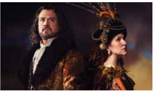
Enchanted Island

TRAVELLING LIGHT COMEDY OF ERRORS SHE STOOPS TO CONQUER ONE MAN, TWO GUVNORS FRANKENSTEIN COLLABORATORS