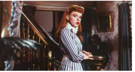
The Complete Vincente Minnelli series