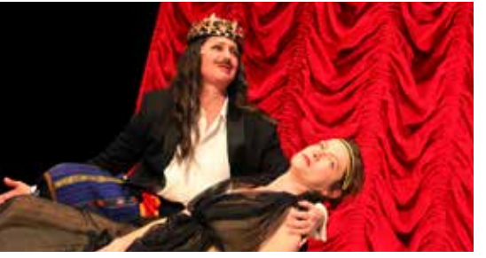
Supernatural Wife

AWAKENING: A MUSICAL MEDITATION ON THE ANNIVERSARY OF 9/11 Kronos Quartet Featuring the Brooklyn Youth Chorus