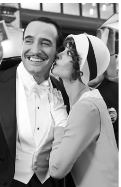
The Artist | Photo courtesy of The Weinstein Company

2011 MIDNIGHT IN PARIS THE TREE OF LIFE BEGINNERS BEATS, RHYMES & LIFE: THE TRAVELS OF A TRIBE CALLED QUEST ANOTHER EARTH SARAH'S KEY THE DEBT PASSIONE AMIGO