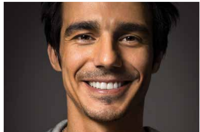
Joaquin De Luz