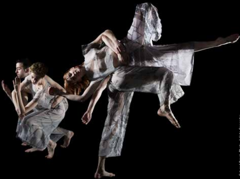
Set and Reset.

cluded works for Trisha Brown, Martha Graham, and Merce Cunningham. She has received seven Tony nominations, the 1976 Lumen Award, 1984 and 1986 Bessies, and a 1980 Obie for Distinguished Lighting, and several Maharam/American Theater Wing Design Awards.